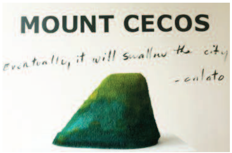
Chantal Calato, Niagara Falls, NY, Mount Cecos , 2019, 100,000 pieces of fringe, sequined fabric and filled with non-biodegradable garbage