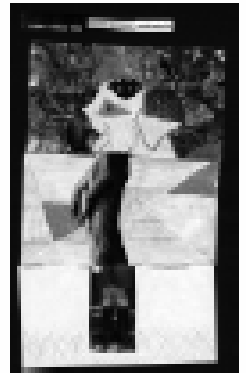
ART 201111306: Media to play the Exquisite Corpse game a lot