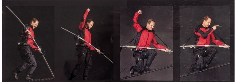
Image Credits: (clockwise from top) Artist Unknown, Signor Guillermo Antonio Farini , 1860, photographic reproduction; (detail) Artist Unknown, untitled (photograph of Jean Lussier and His Rubber Ball), circa 1950, photograph; Artist Unknown, Nik Wallenda King of the High Wire (autographed by Nik Wallenda), 2012, color reproduction; Unknown Artist, graphic reproduction of a photograph of The Niagara Falls Museum and Daredevil Hall of Fame, n.d., commercial reproduction.