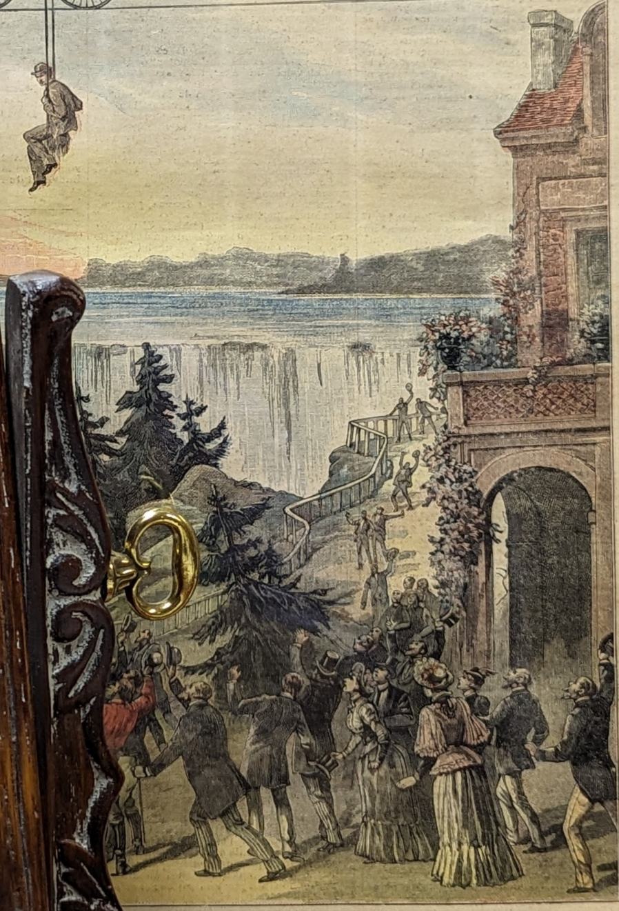
La Gaité dans l

CASTELLANI ART MUSEUM OF NIAGARA UNIVERSITY