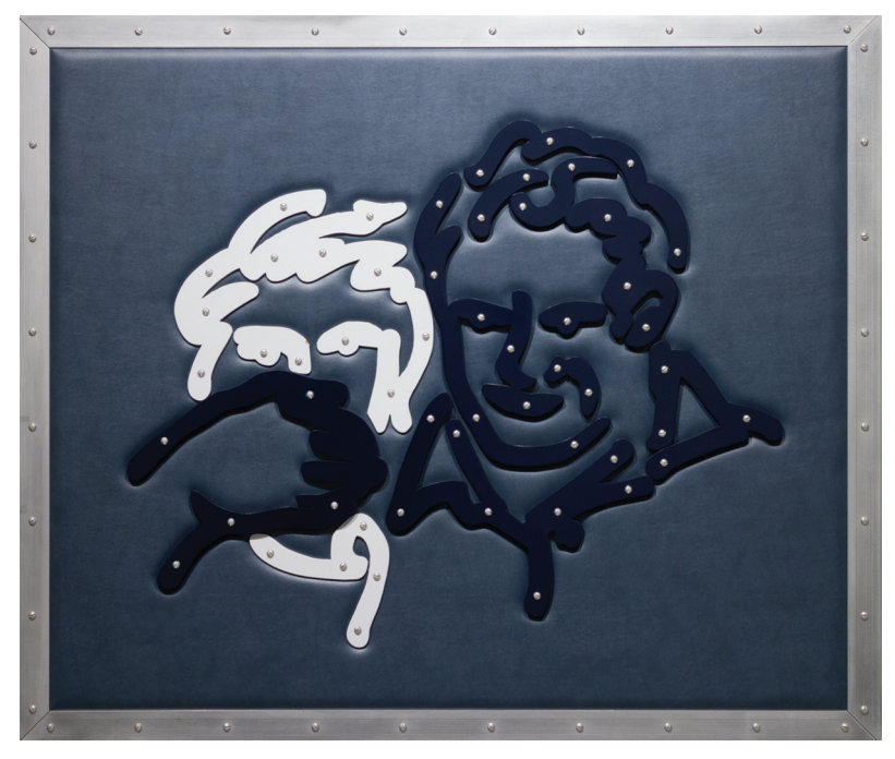
Censored: Boss Attack, 1983, aluminum, vinyl and lacquered board, 43% x 54% x 2 in. Collection of Steven Biltekoff and Cecile Biltekoff.