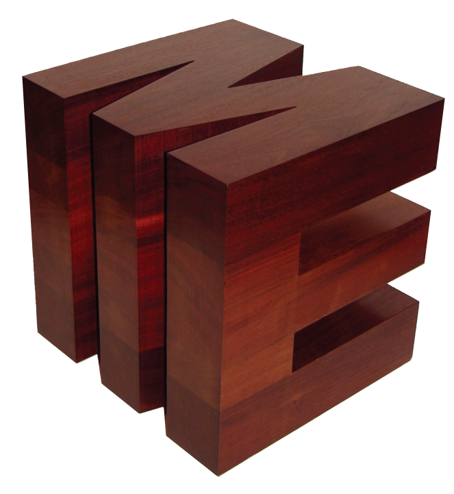
Me Block, 1990-91, wood, brass, edition 9/40, 14% x12% x13% in. Collection of Gerald Mead, Buffalo, NY.