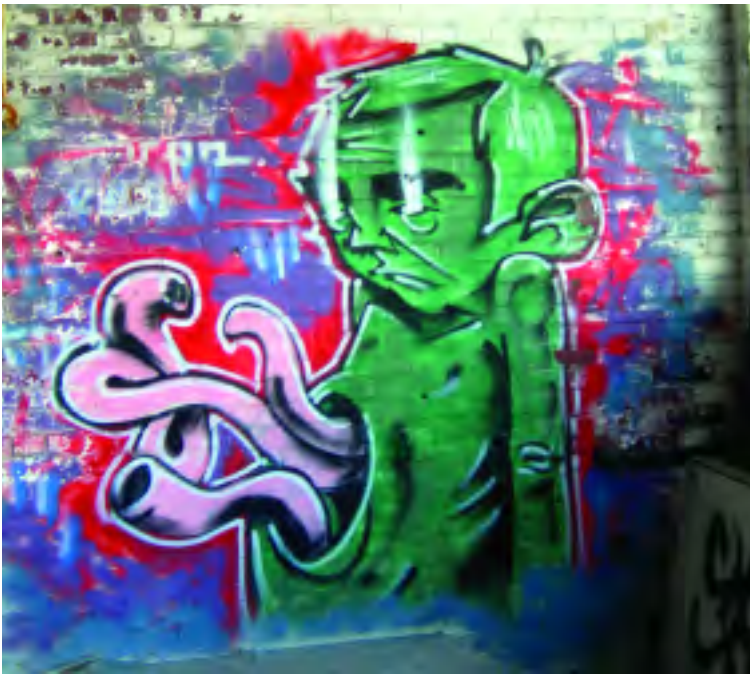
Untitled, n.d., spray-paint on brick.