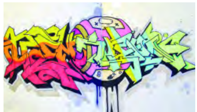
Untitled (Sketch), 2007, ink on paper/Moleskin sketchbook, 5 x 9 inches.