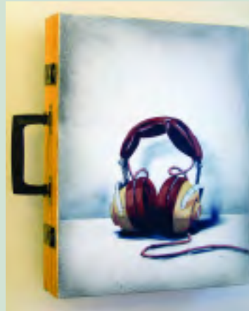
Listening , 2009, mixed media on briefcase 17 x 13 inches.

My artwork, predominantly paintings and drawings, deals with a variety of subject matter in what I call "today's visual language." Each piece I make has the freedom of expressing itself