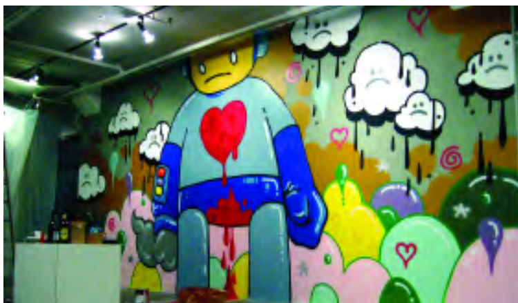
Love Life, 2004, mixed media on wall, approx 170 x 480 inches.