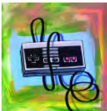
Controller 3 , 2009, mixed media on canvas 12x12 inches.

Ever fearful of the pigeon-holing effects artists experience Holt employs a menagerie of artistic styles, materials and influences to stay well ahead of his own "stylized demise." He states, "My deliberate attempt to switch up influences and style is mirrored in my amusement of channel surfing." He is notorious for periodically working 14-hour days of what he refers to as "sporadically creative periods." Holt's fortitude finds him working