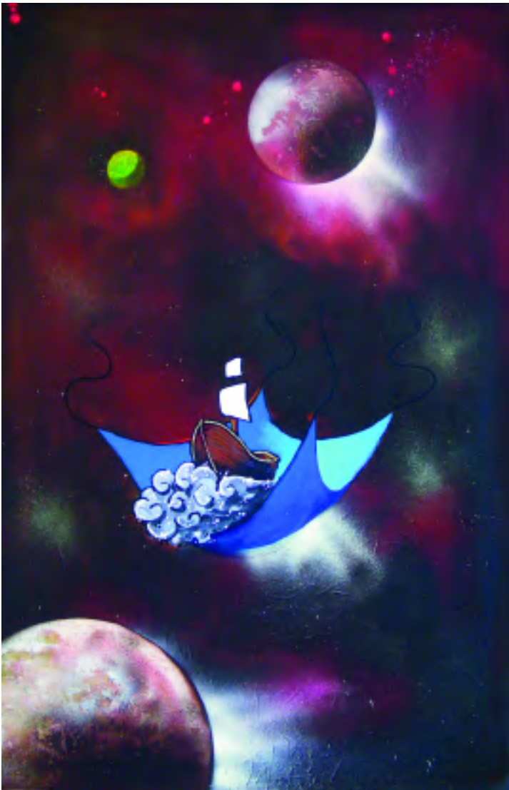
Sailing , 2009, mixed media on canvas, 29.5 x 19 inches.